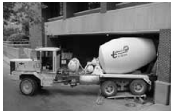
One of dozens of cement trucks involved in the basement buildout project.