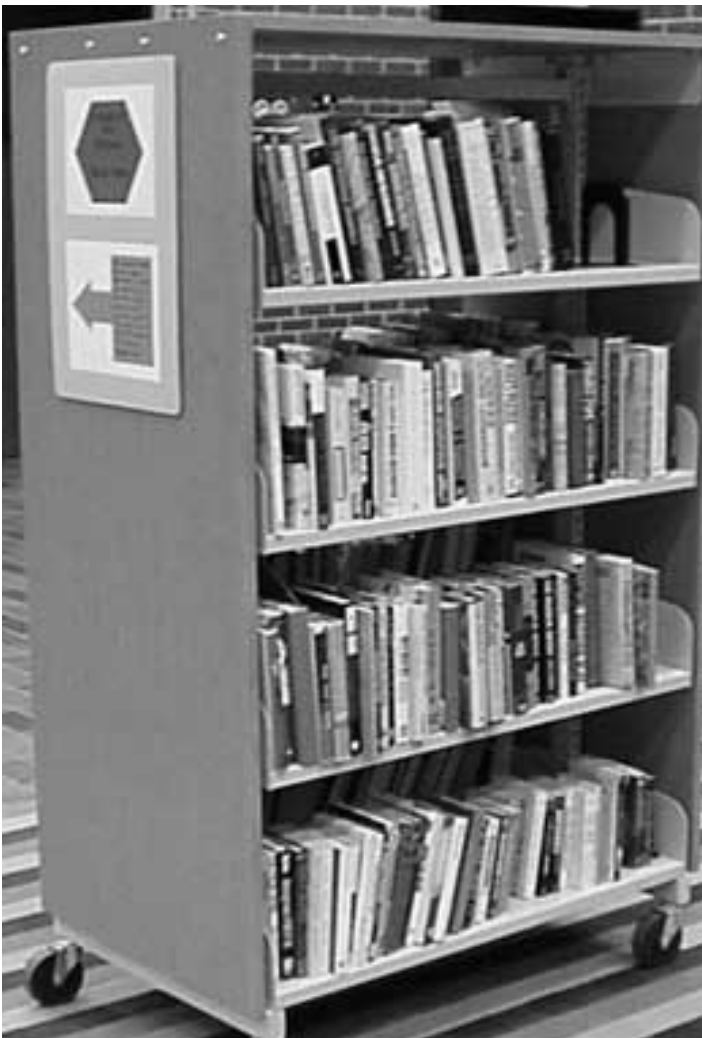
Friends of the Library Book Sale Truck, Founders Memorial Library, First Floor